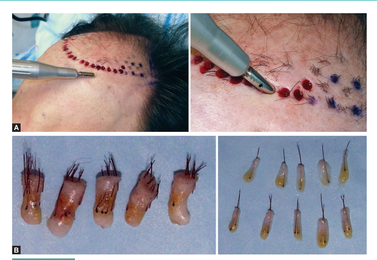
Figures 21.2A and B