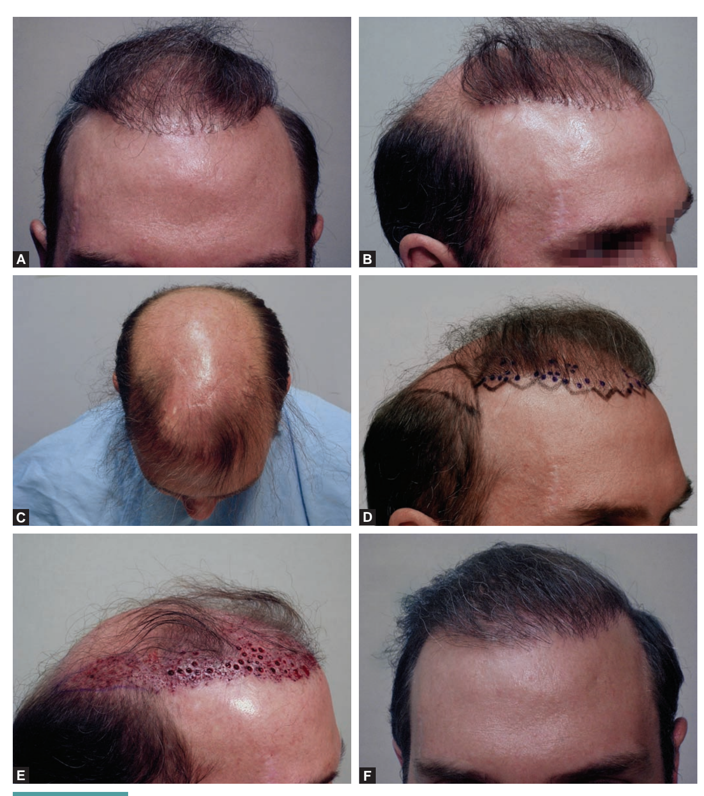
Figures 21.3A to F