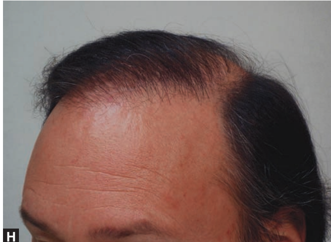
Figures 21.4A to H

Correction of cosmetic problem after hair transplant using linear excision of anterior hairline and PR & R: (A and B) This 43-yearold man underwent hair transplantation when he was 23-years old. Not only did he have progressive hair loss exposing the hair grafts over time but also the 4-mm plug grafts appear very unnatural. His desire was to perform a procedure to eliminate the plugs as quickly and directly as possible; (C) Intraoperative appearance is shown immediately following linear excision of the anterior row of plugs; (D) Appearance of the excised anterior row of plugs is shown prior to recycling of the grafts; (E) Grafts are recycled from the excised specimen; and additional primary donor-site harvested grafts are immediately transplanted anterior to the closure and within the forelock distribution as the first stage of recreating the new hairline; (F) Second-stage grafting is shown to the hairline and forelock from primary occipital donor harvest as well as additional PR & R to the remaining plugs; (G and H) The final result is shown 8 months following the last procedure. A total of 2,200 grafts and 120 plugs were recycled through direct excision as well as PR & R