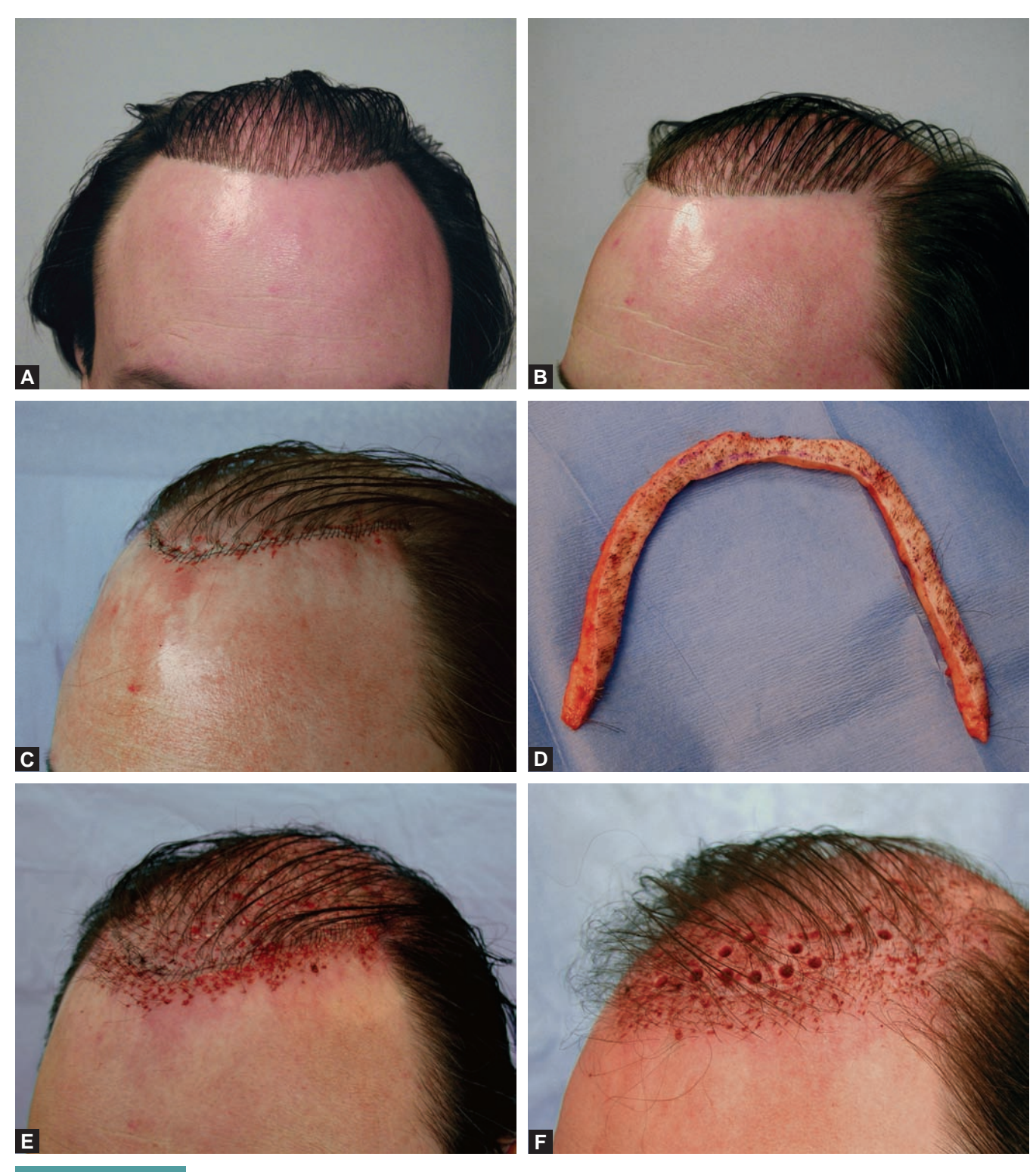
Figures 21.4A to F