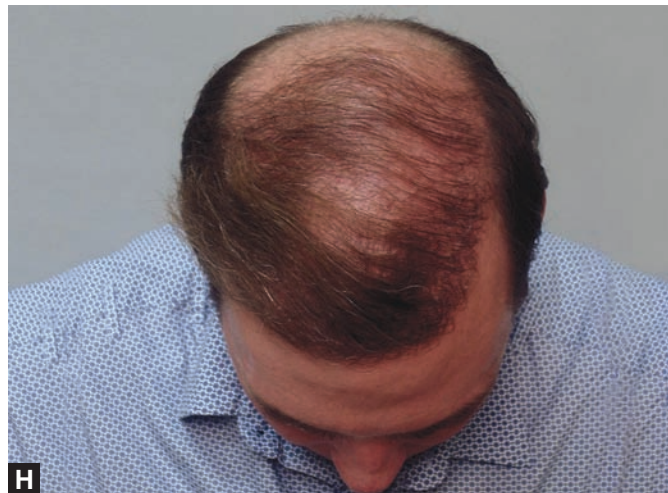
Figures 21.3A to H

Correction of cosmetic problem after hair transplant using plug reduction and recycling: (A to C) This 38-year-old man who had previously undergone a hair transplant in his mid 20s. The patient had experienced progressive hair loss with resulting exposure of previously transplanted 4-mm "plug" grafts. In addition, he was unhappy with the exposed areas of scalp above his ears that resulted in "alleys" of baldness; (D) Preoperative markings are shown prior to the first procedure. The dots indicate the location where plugs are to be removed. The irregular anterior hairline is also marked. Dome-shaped marking in the area of the lateral hump above the ears indicates planned distribution of grafts to fill in bald "alleys" of scalp; (E) Intraoperative appearance is shown following first stage PR & R and additional grafting from the traditional donor harvest; (F to H) Final result is shown following a third session of PR & R and additional grafting. In total, the patient underwent removal and recycling of approximately 252 4-mm plug grafts and implantation of 2,000 follicular-unit grafts over a 2-year period. The patient was also maintained on finasteride oral medication. Note the forelock-pattern reconstruction